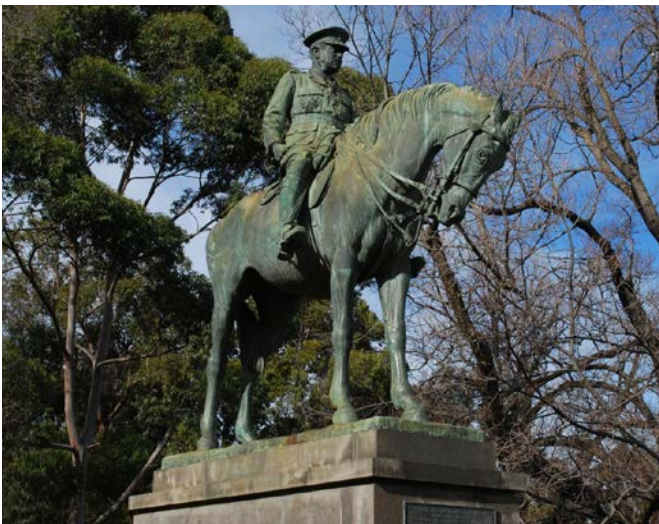
The statue of General Sir John Monash was erected in King's Domain, Melbourne in 1950.