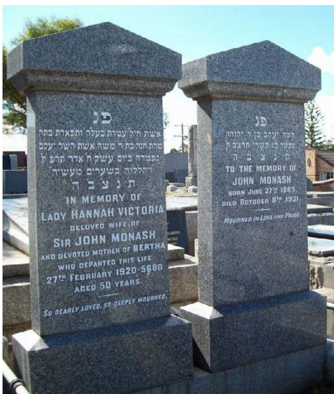
General Sir John Monash was buried in Brighton General Cemetery. In a final sign of humility, despite his achievements, honours and titles, he instructed that his tombstone simply bear the words “John Monash”.